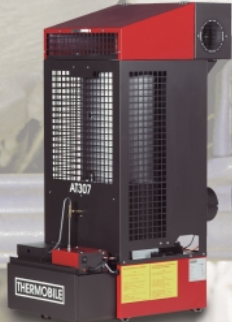
AT 307: 100,000 BTUH