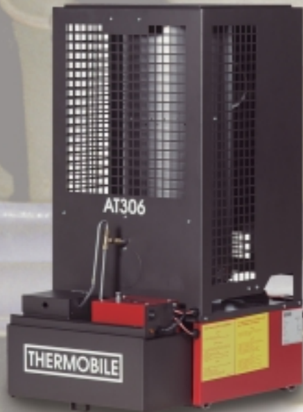
AT 306: 100,000 BTUH

A Thermobile Used Oil heater is the smart way to utilize used oil, transmission fluid, hydraulic fluid, synthetic, and cooking oil to heat your shop. The EPA approved method of recycling used oil while burning it on site for heat recovery eliminates costly hauling fees, "cradle to grave" disposal liability, and heating costs. Used oil heating technology permits the end user to recover the investment costs within possibly one heating season because of the savings from using waste fluids instead of increasingly expensive fuel oil.