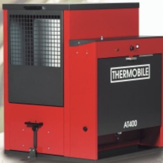
AT400: 140,000 BTUH