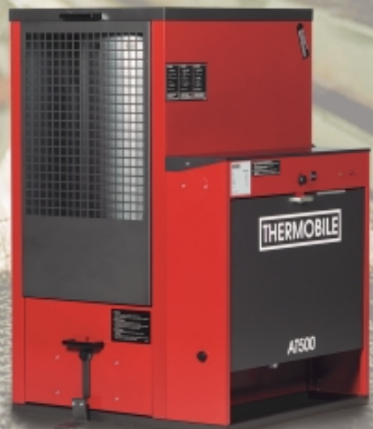
AT500: 200,000 BTUH