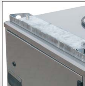
Stackable With Crane Hooks