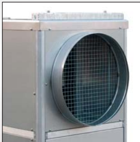
24" Distribution Head

Stainless steel frame on box girders with fork lift slots and lifting hooks.