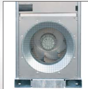
Backward Incline High Efficiency Blower