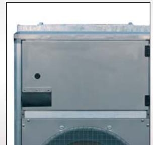
Lockable Control Panel Cover