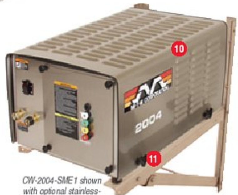
CW-2004-SME1 shown with optional stainless-steel wall mounting bracket (AW-9501-0000).