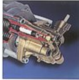
KEW Pump Technology