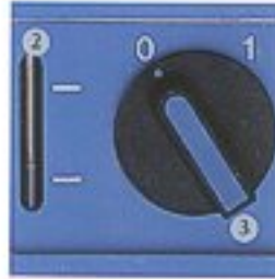
Visible Oil Level Indicator