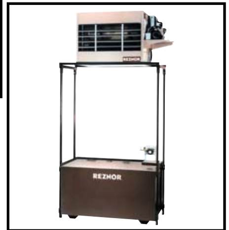
Recycling Center: Unit Heater, Workbench Tank and Heater Stand