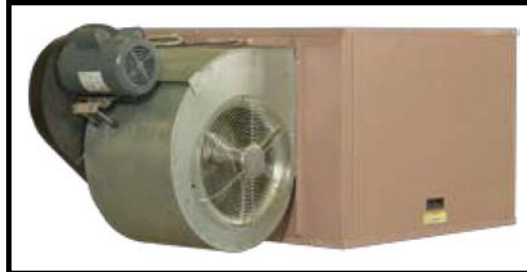
Blower Ductable Furnaces