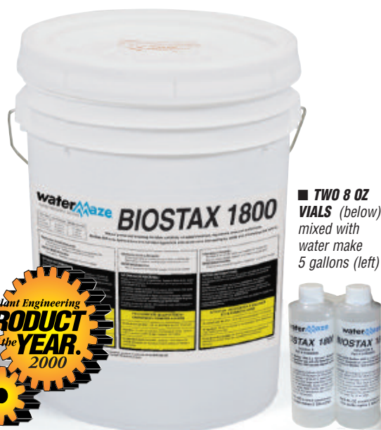
■ TWO 8 OZ VIALS (below) mixed with water make 5 gallons (left)

Important: BioStax 1800 must be kept refrigerated prior to use.